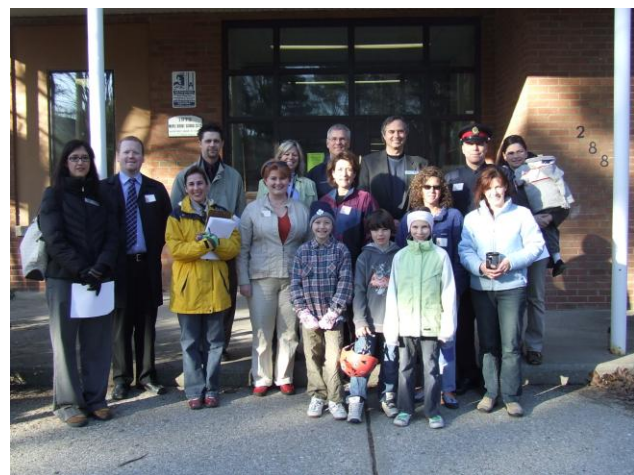
Halton Region’s Maple Grove STP Committee – bringing the community together for School Travel Planning

Infrastructure changes and / or additions that contribute to more walkable, safer routes to school benefit the entire community by building the capacity for all residents to use active transportation for short trips. Getting more people on the streets walking and cycling to local destinations contributes to a sense of connectedness and increased quality of life. As ASRTS programs have proven, collaboration among community agencies towards support of active school travel choices also increases the connectivity of communities by showing citizens that agencies can work together toward similar goals. Collaborative work among agencies also raises the profile of important issues that affect