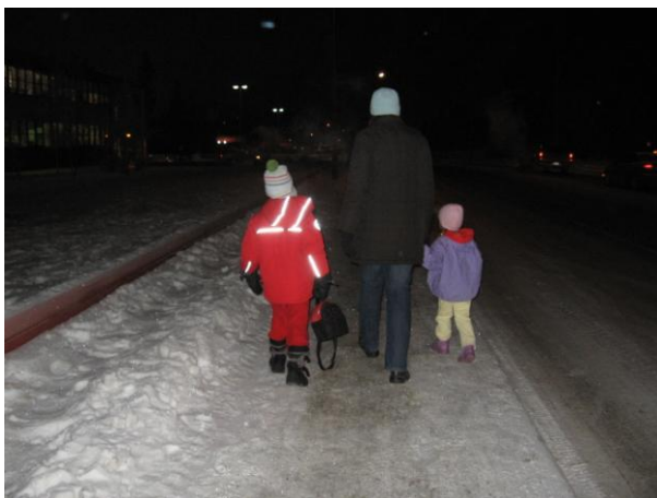
Yukon – reliable clearance of snow from sidewalks ensures safer routes for children choosing active travel in winter

Snow removal from a school parking lot is covered by District School Boards and so the cost is rarely observed or scrutinized by the schools that need it. It would be interesting to know just how much money is spent clearing snow from lots and lanes built to accommodate children driven to school, but this data is not currently available. If schools had less paved space, this cost could clearly be reduced.