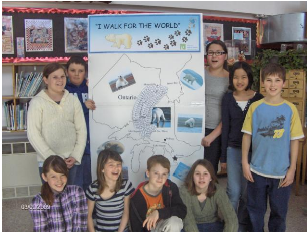
Laird Central School – Children pose with IWALK poster

Ontario curriculum has responded to growing health and environment concerns, as demonstrated by the mandate for 20 minutes of Daily Physical Activity, the Healthy Schools Recognition initiative, a growing movement towards EcoSchools initiatives, and new directives in environmental education.