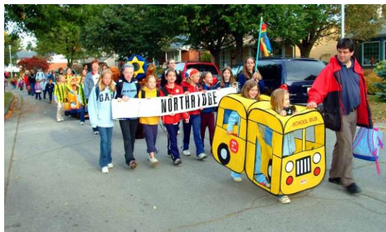
London – This Walking School Bus can help eliminate the need for school buses

While different boards of education have varying safety and age concerns that dictate the walkable distance from the school, it is possible that refinement of the board-approved walking distances can