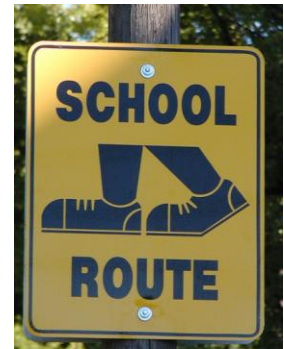
London, ON - Clearly marked school routes show due diligence by marking the best routes to school