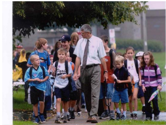
Children walk to school with their principal on IWALK day

As a response to the growing need for a strategy based on these goals, Green Communities Canada (GCC) has worked extensively with the Centre for Sustainable Transportation to create and promote the Child and Youth Friendly Land Use and Transport Planning Guidelines for Ontario (see www.kidsonthemove.ca ). According to these Guidelines , the needs of children and youth should receive as much priority as the needs of people of other ages and the requirements of business when it comes to land use and transport planning. The Guidelines and the School Travel Planning (STP) model work hand in hand to create opportunities for safe, active travel to and from school.