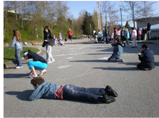
Celebrating Earth Day – children drawing and playing safely on a parking lot closed to traffic

Paving companies typically charge $3 - $4 per square foot for the paving costs alone – the costs of tree removal, leveling, drainage, city sewer hookup and site plan approval would be additional and add up to hundreds of thousands of dollars per job. 18 As an example, Park View Education Centre in Nova Scotia received long-awaited funds in the spring of 2009 to build a new parking lot intended to alleviate traffic congestion at the high school that serves 869 students. 19 The estimated cost for the parking lot overhaul is $250,000. 20