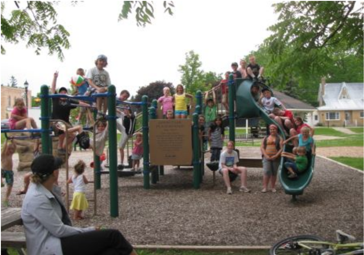
Children take a brief break from Capture the Flag to pose for a photo in Ripley