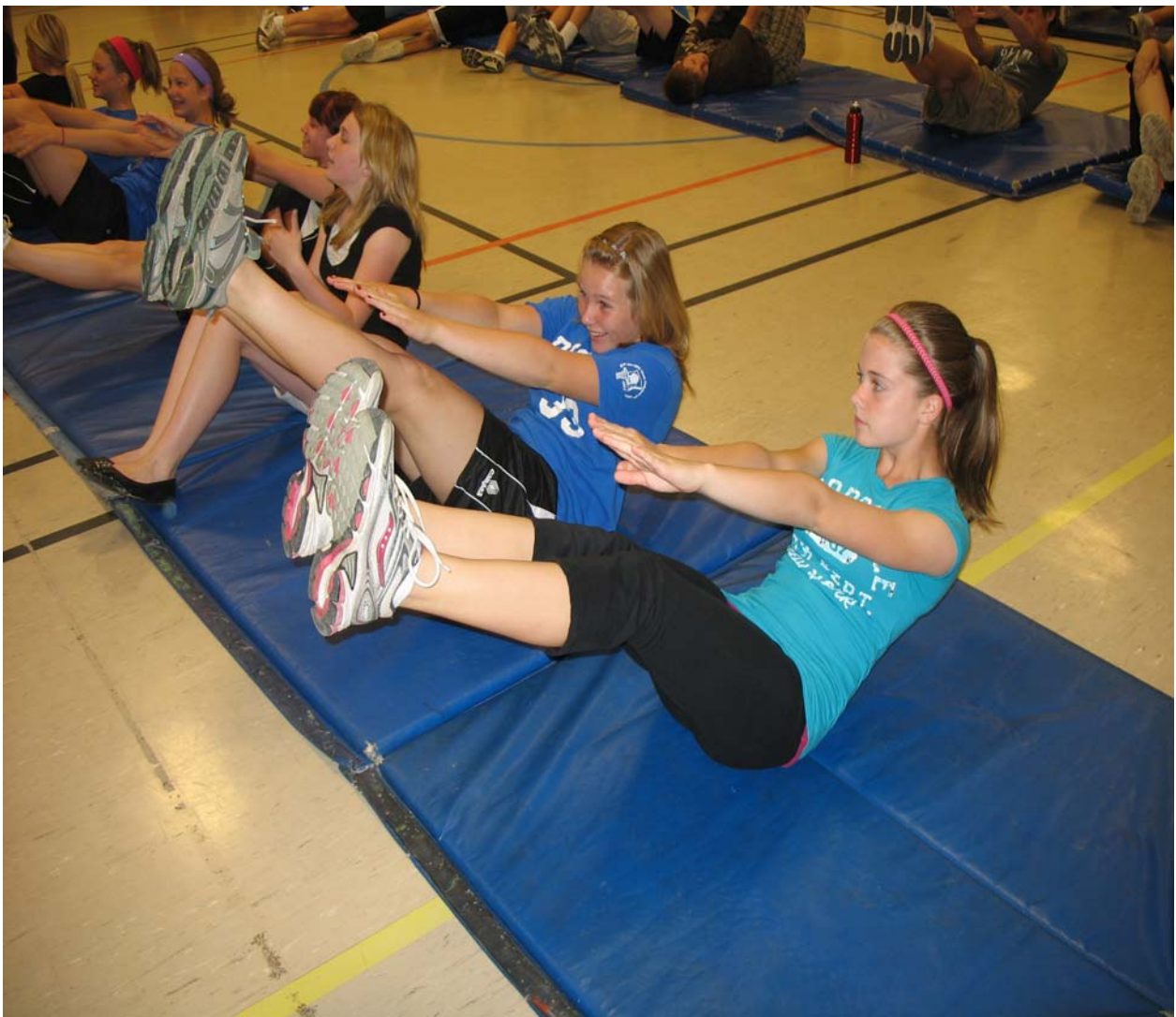
Students at Huron Heights test their core strength while being put through the paces in a workout provided by a personal trainer

The Municipality hosted a number of events at Lion's Park and at the Davidson Centre including parachute games, face painting and a BBQ hosted by the Youth Waves Coalition . The Master Blast Fitness Class included an introduction to Zumba, Bootcamp, Cardio Blast and Functional Fitness. In addition, Huron Heights school took part in Yoga on the Yard, a Personal Fitness session and learned some new rugby skills. The day was topped off with a free swim at the Davidson Centre.