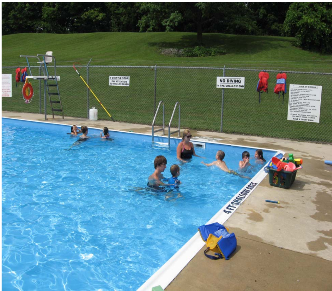
Families enjoy the first free swim of the season at the Chesley pool

Arran Elderslie participated in the Longest Day of PLAY, with a variety of activities, games and events. Activities included horse shoes, soccer, picnic in the park, fitness classes and so much more. The feature event was an evening in the park that included games and activities for the children, a fire truck to explore, a BBQ, free swim and a Cops for Cancer Shave off. In all, approximately 675 people were involved in the organized activities of the Longest Day of PLAY and many more were active on their own. The day was a great success in Arran Elderslie and organizers would like to thank all those who were involved.